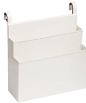
CHART AND X-RAY HOLDER